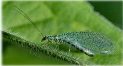
Green lacewing adult & larvae