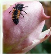
Lady beetle adult & larvae